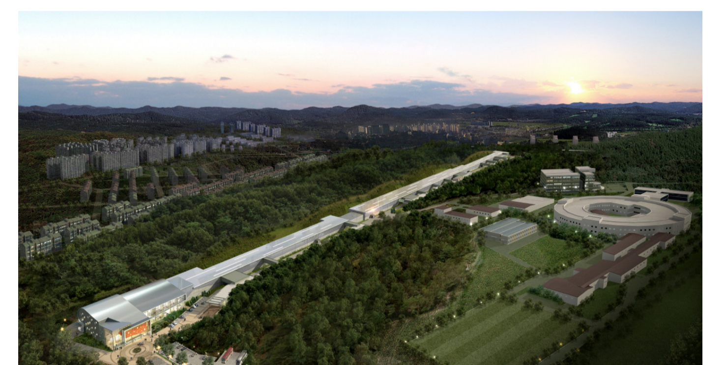
PAL-XFEL, Pohang, South Korea