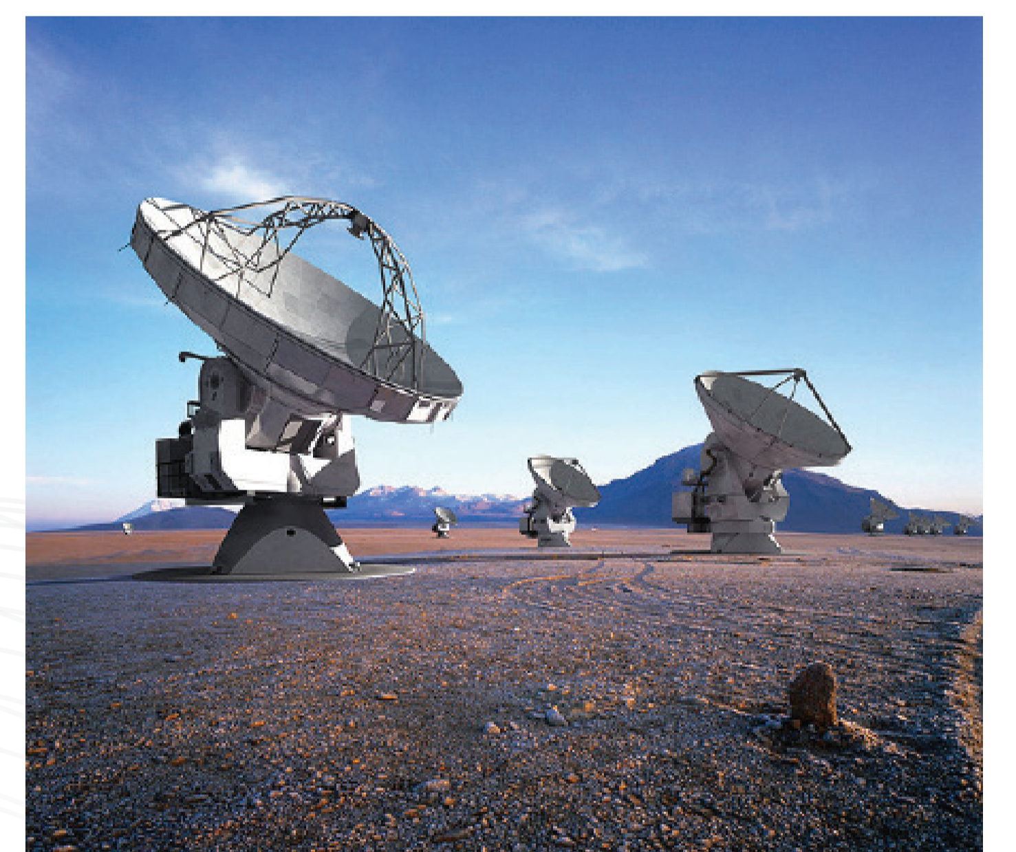
ALMA Telescope, Chile